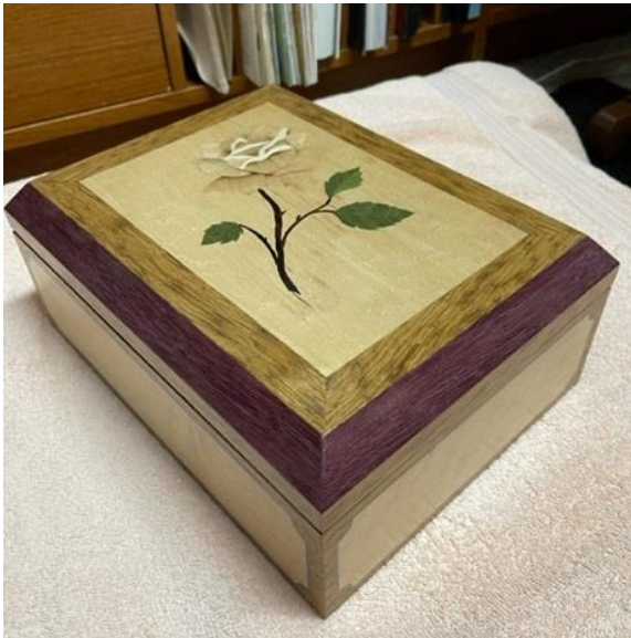
I call this the royal box. I made this when EIIR died. A sand-shaded English rose in brown oak, birdseye maple, purple heart and lined with royal purple felt.