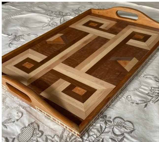
Teak tray with a continuous illusion pattern in walnut, oak, and elm in walnut burl with banding on the outside.