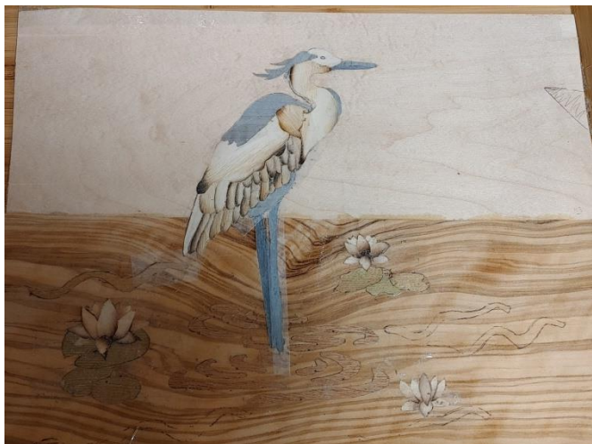
Blue Heron for a tray.