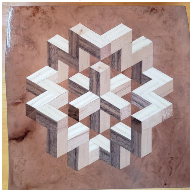
Approx size 8.75" x 8.75". This is mounted on an ash slab from a tree that had been invaded by the emerald ash borer beetle and need to be taken down. The back of the slab shows the tunneling the larvae make as they feed on the inner bark. The finish is water based varathane.