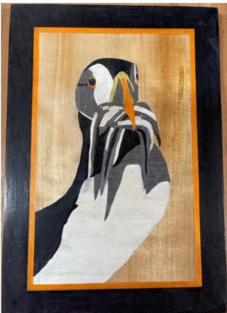
This image was based on a pen sketch by my talented Scottish uncle of his favourite bird the puffin having a meal!