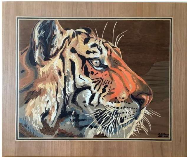
The pattern by Linda Rossin, a side view of the face of a tiger overall size 17 1/2" hours x 14" . Seven coats of semi-gloss varathane was foam brushed on.