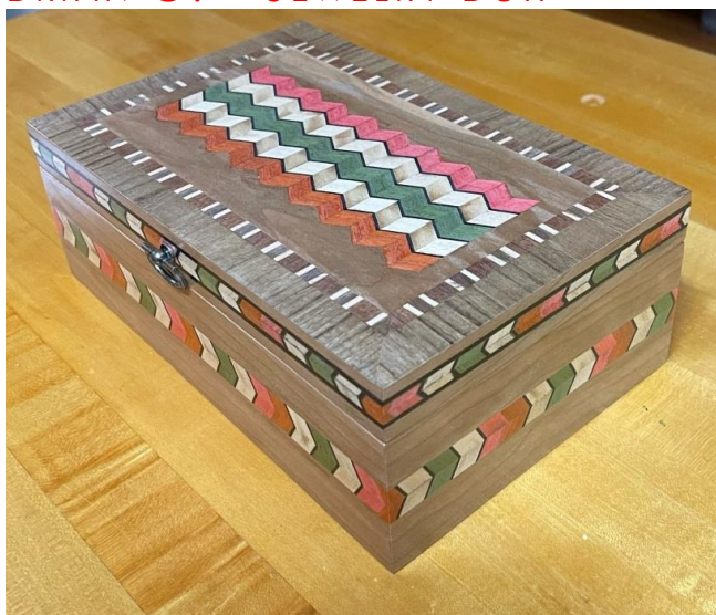
Cherry-veneered box with continuous, multi-coloured bandings.