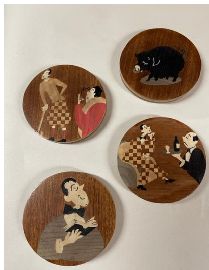
I enjoy reading P. G. Wodehouse and I copied 4 Penguin covers and made some coasters just for fun. Challenging making Bertie's checkered suit in miniature!