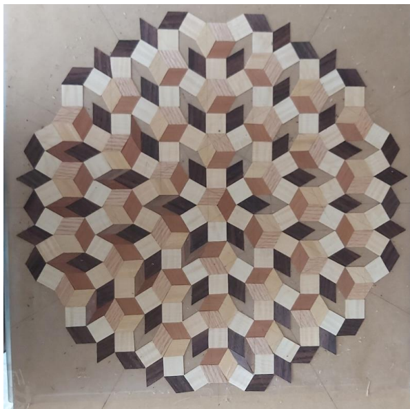
Work in progress. Image size will be 17 inches round.